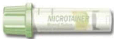
365985 Mint Green

For plasma determinations in chemistry. Tube inversions prevent clotting.