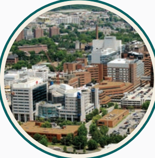
10 MILLION SQ. FT. Vanderbilt University Medical Center's building footprint